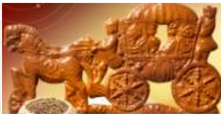
Gingerbread of Toruń