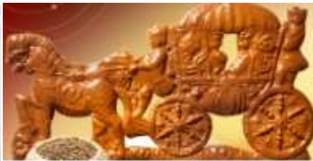
Gingerbread of Toruń